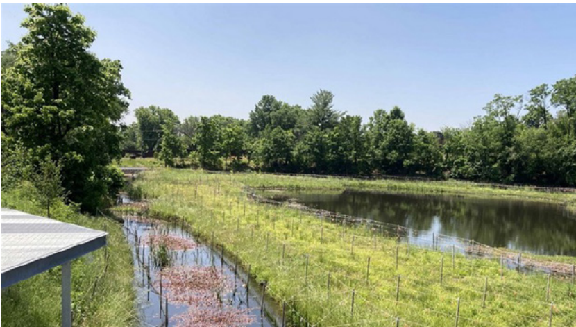
Ballston Wetland Park

For more information on how to reduce your flood risk, visit the county webpage which includes tips on reducing your flood risk and provides a home flood-prevention checklist.