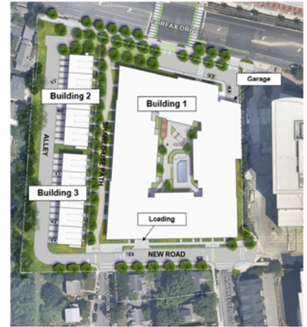
Proposed Site Layout from 4600 N. Fairfax Site Plan

BCA pressed the County and developer on concerns raised by our members and residents regarding the impact on residents during construction. Those concerns were not answered, and BCA was told discussions on neighborhood impact and related mitigation would not occur until after the County approved the site plan. Now that the site plan has been approved, BCA intends to support nearby residents in dialogue with the County and the developer on construction impact mitigation.