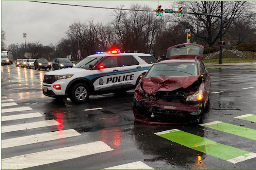
Dec. 29, 2021 accident on Wilson Blvd.

(See meeting minutes for details and resolutions.)