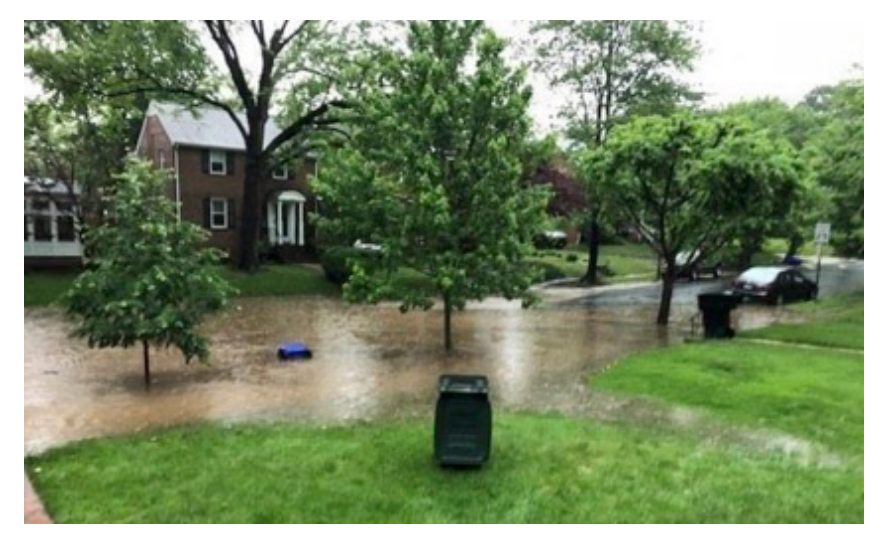
Flooding in the Lubber Run Watershed