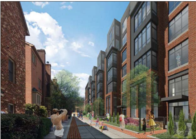
Rendering of alley behind 672 Flats

Final meetings for the Exxon block conclude in Oct. The project—a 6-story, 178-unit apartment building with ground-floor retail—will include approximately 8 onsite committed affordable units. The primary sticking point has been the loading dock's location. The Penrose Group (the applicant) and the community want the loading dock placed on 7th Street North. County staff has insisted that the county's discretionary alley "policy" must be followed and prefers the loading dock to be placed on the alley rather than on 7th Street, despite residents' objections. The County Board will decide the matter on 10/17 (after this publication goes to press).