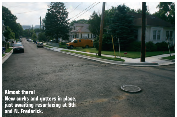
Almost there! New curbs and gutters in place, just awaiting resurfacing at 9th and N. Frederick.

On June 11, the Neighborhood Conservation Advisory Committee (NCAC) voted to approve nine NC projects to receive bond funds. BCA's first-priority curb, gutter, sidewalk and lighting project for N. Frederick Street (the second half of the 9th Street N./N. Frederick Street project) was not approved for funding. ➔4