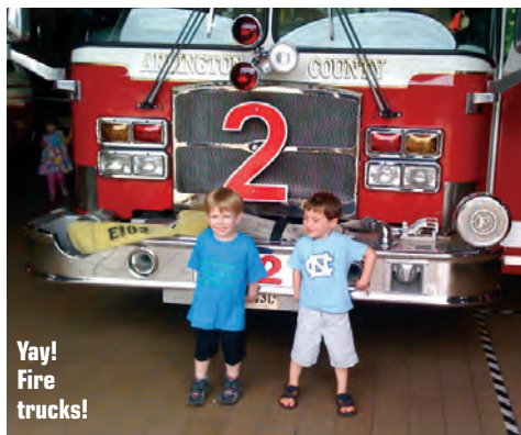
Yay! Fire trucks!