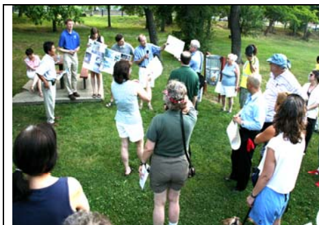
Lacey Woods Park and North Bluemont area residents present photographs of storm water management and street repair concerns at June 18 WTM