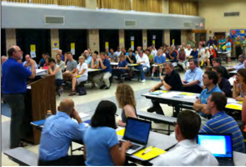
Overflow crowd at the June Annual Meeting