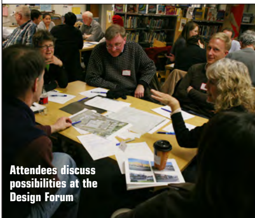
Attendees discuss possibilities at the Design Forum