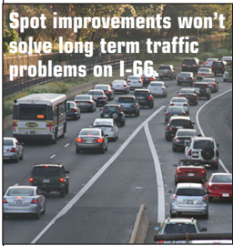
Spot improvements won't solve long term traffic problems on I-66

The Virginia Department of Transportation (VDOT) is moving ahead with the first of three "spot improvements" to I-66 inside the beltway. VDOT chose this incremental highway-widening strategy to take advantage of "categorical exclusions" that would permit the state and VDOT to avoid meeting National Environmental Policy Act (NEPA)