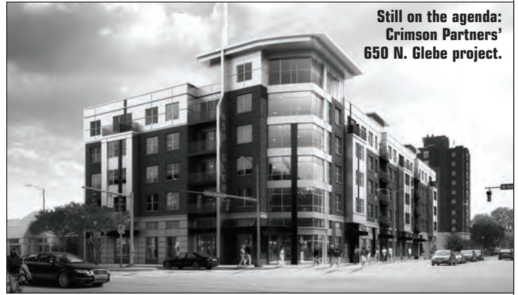
Still on the agenda: Crimson Partners' 650 N. Glebe project.

5-story, mixed-use building that will replace the Goodyear tire center located at 650 N. Glebe Road. The building will be Leadership in Energy and Environmental