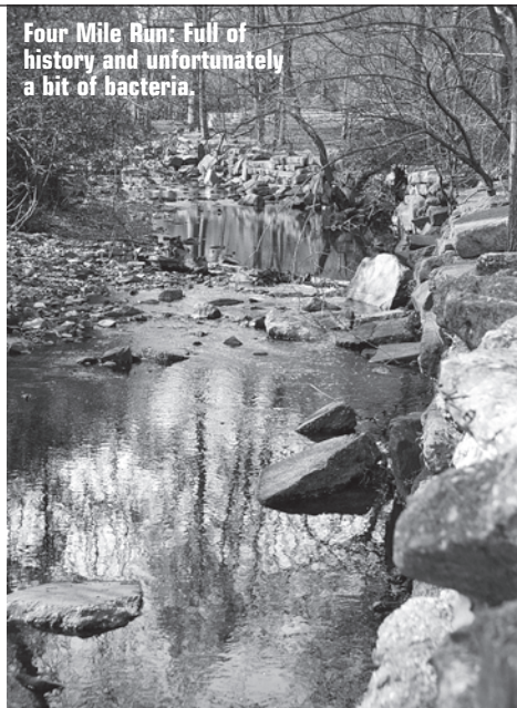
Four Mile Run: Full of history and unfortunately a bit of bacteria.

■ Keep stream water out of your eyes, ears, mouth or any open sores.